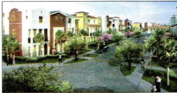
A rendering shows the 155-unit East Village in Davie, which is being developed by BCHA and Carlisle Development.