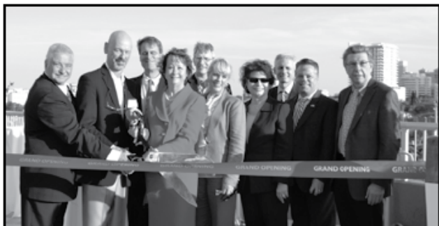
Progresso Point celebrates its grand opening.

Progresso Point, a new affordable housing property co-developed by Broward County Housing Authority and Reliance Housing Foundation, recently celebrated its grand opening. The ribbon cutting, held on the building's fourth-floor pool deck, was framed by a panoramic view of downtown Fort Lauderdale. The event was marked by a City of Fort Lauderdale proclamation recognizing Feb. 22,